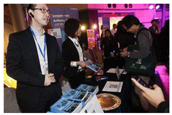
TABLE TOP PLACEMENT

Having a table top placement at the entrance of a selected conference room of your choice provides attendees with a copy of your company brochure when they enter the room; serves as excellent reading material while waiting for programs to start.