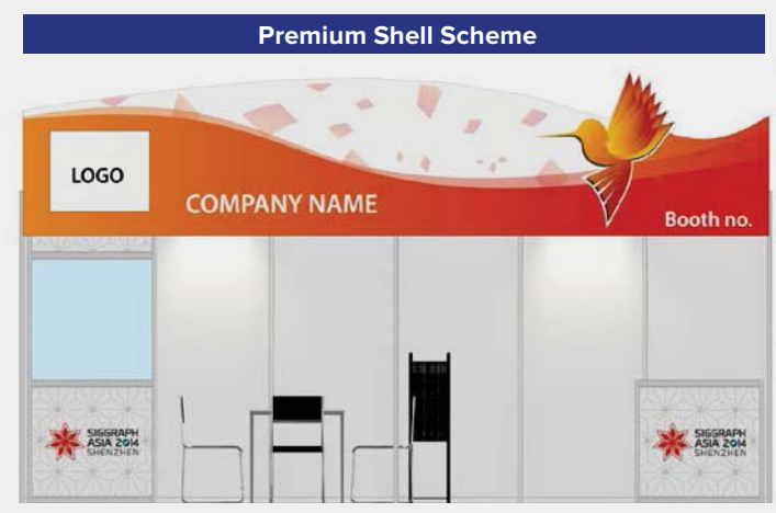
Note: The above booth visuals are based on SIGGRAPH Asia 2014 and are subject to change at a later date. Rates are subject to 8% consumption tax.